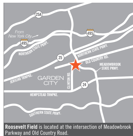
Roosevelt Field is located at the intersection of Meadowbrook Parkway and Old Country Road.